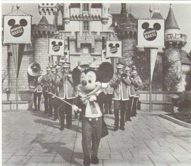
STRIKE UP THE BAND —Mickey Mouse leads the procession as OPERATION MOUSE, one of the most exciting Magic Kingdom Club specials comes to Disneyland in January, 1968. Operation Mouse means special values in attractions, food and merchandise for clubmembers. See your Precisioners building representative for free MKC membership card and information about OPERATION MOUSE.

The Biblical scene depicts shepherds, watching over their flocks, near Bethlehem on the first Christmas nearly two thousand years ago.