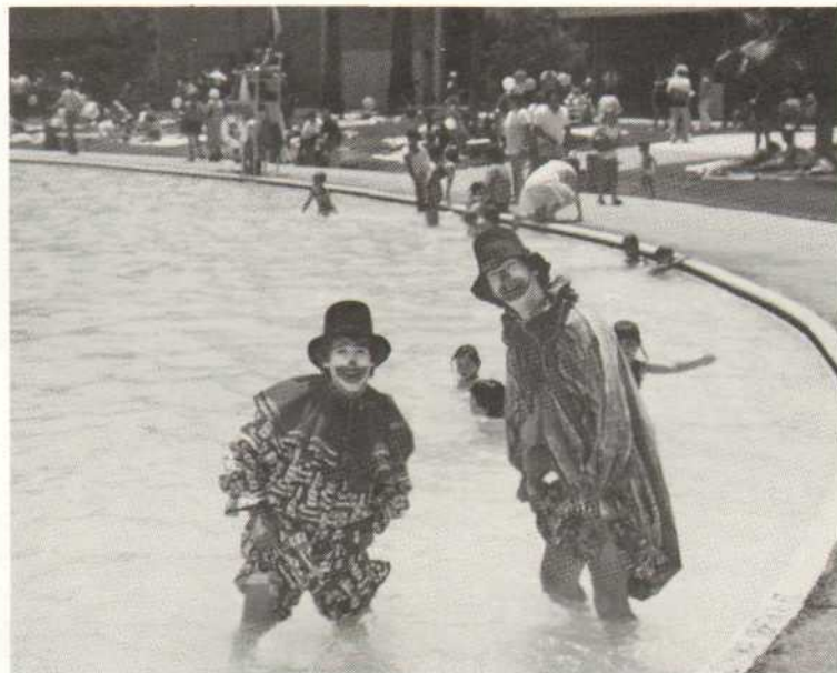
There's fun "a-plenty" in store for Librascope employees July 17 at the 1982 Family Roundup. For details concerning this popular annual event, see story at left.

At the conclusion of the Advanced Development phase, the U.S. Army plans to enter Engineering Development and Final Engineering Design phases. Each phase will be under a separate contract.