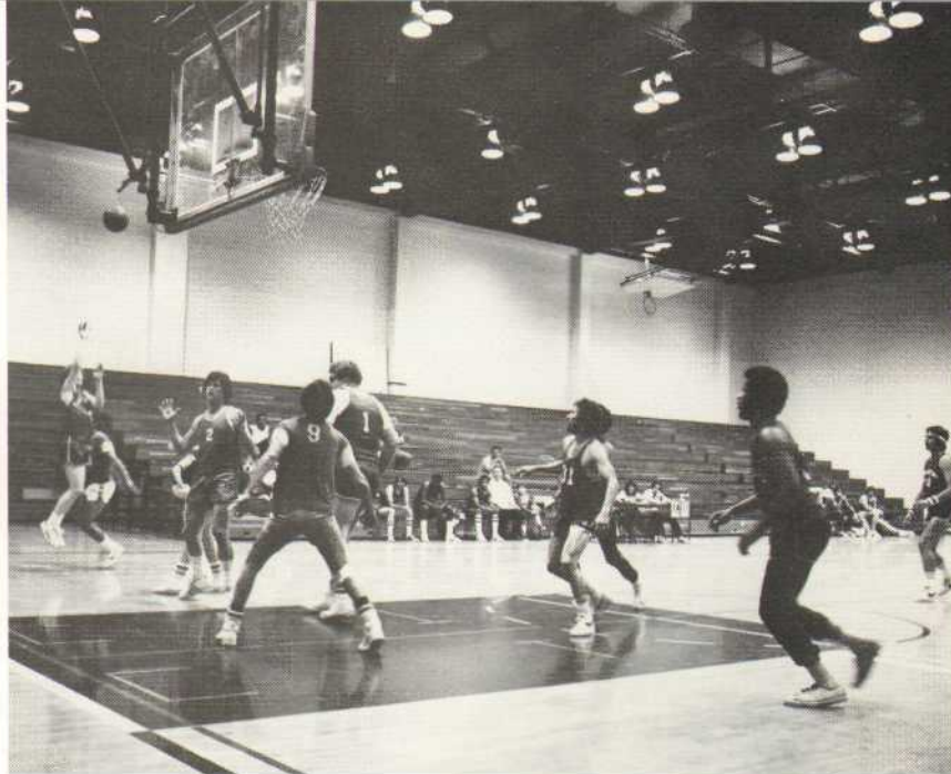
Although ahead 14-11 at the time of this photo, Librascope's "A" team bowed to Sweetwater, 54-51 in the championship playoff.