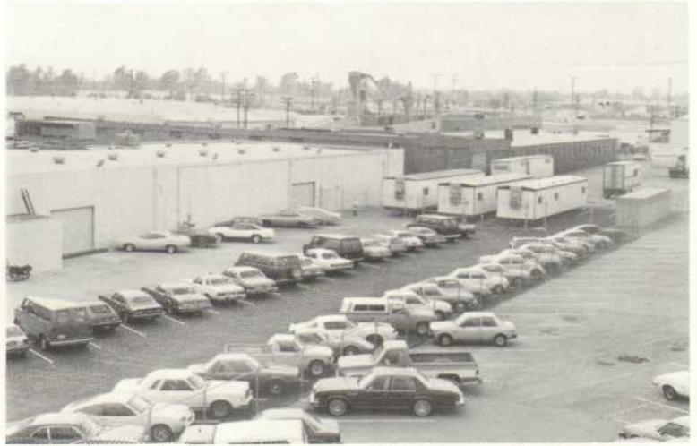
Building #6, acquired in 1981, with new modular buildings added this year, shown on right.