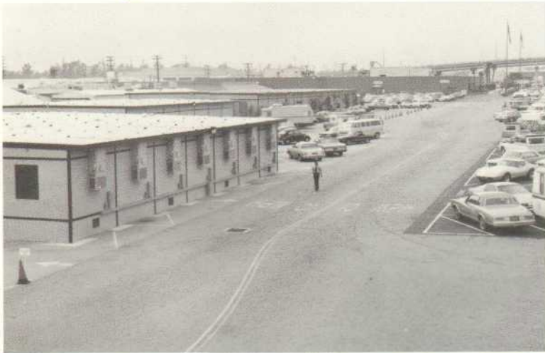
Buildings added this year, on left, #7, #5A, & #5, (formerly parking area). Building #3 is shown in background.