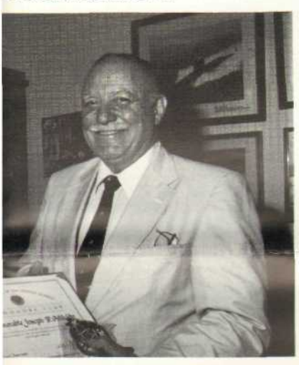
ashington, D.C. Marketing Office, serving in il of the Navy League of the United States, exclusive Commodore Club to Congressmand Services Committee of the U.S. House of