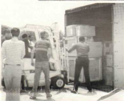
First fifteen production TCT's leaving Librascope for fielding with the U.S. Army VII Corps in Europe.