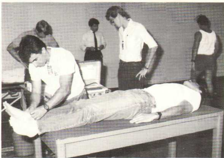
YMCA staff member conducts fitness evaluation on Librascope employee.

Over 100 Librascope employees recently underwent a fitness evaluation test conducted by the Glendale YMCA. Each participant was given a computerized test which gave them a printout of their current percent of body fat, target heart rate, resting heart rate, resting blood pressure and basal metabolism, along with recommendations to reduce, increase or maintain their body weight. The recommendations included a daily caloric count and exercises for each individual.